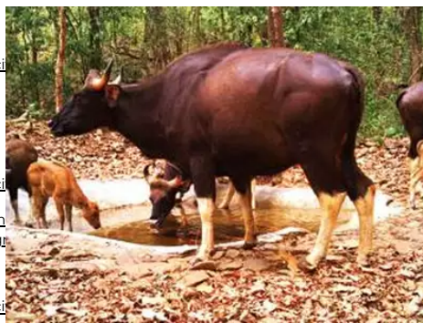
Waterholes of the dry areas of the forest, one artificial waterhole was built for animals to quench their thirst

(https://timesofindia.indiatimes.com/city/goa/write-to-javadekar-on-proposed-projects-in-mollem-forest-areas/articleshow/77773053.cms)